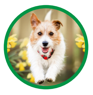
72.7 million Dogs